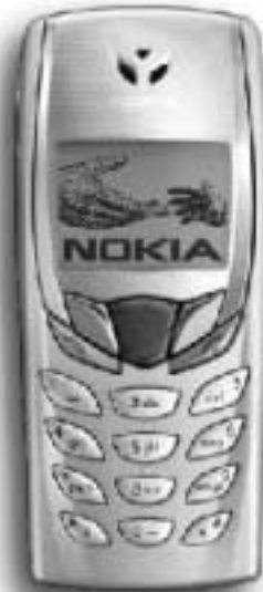
Figure 1: Transceiver NSM-9DX

The NSM-9DX is a dual band transceiver unit designed for the GSM850/1900 networks. It is a GSM850/1900 power class 1 (1W) transceiver.